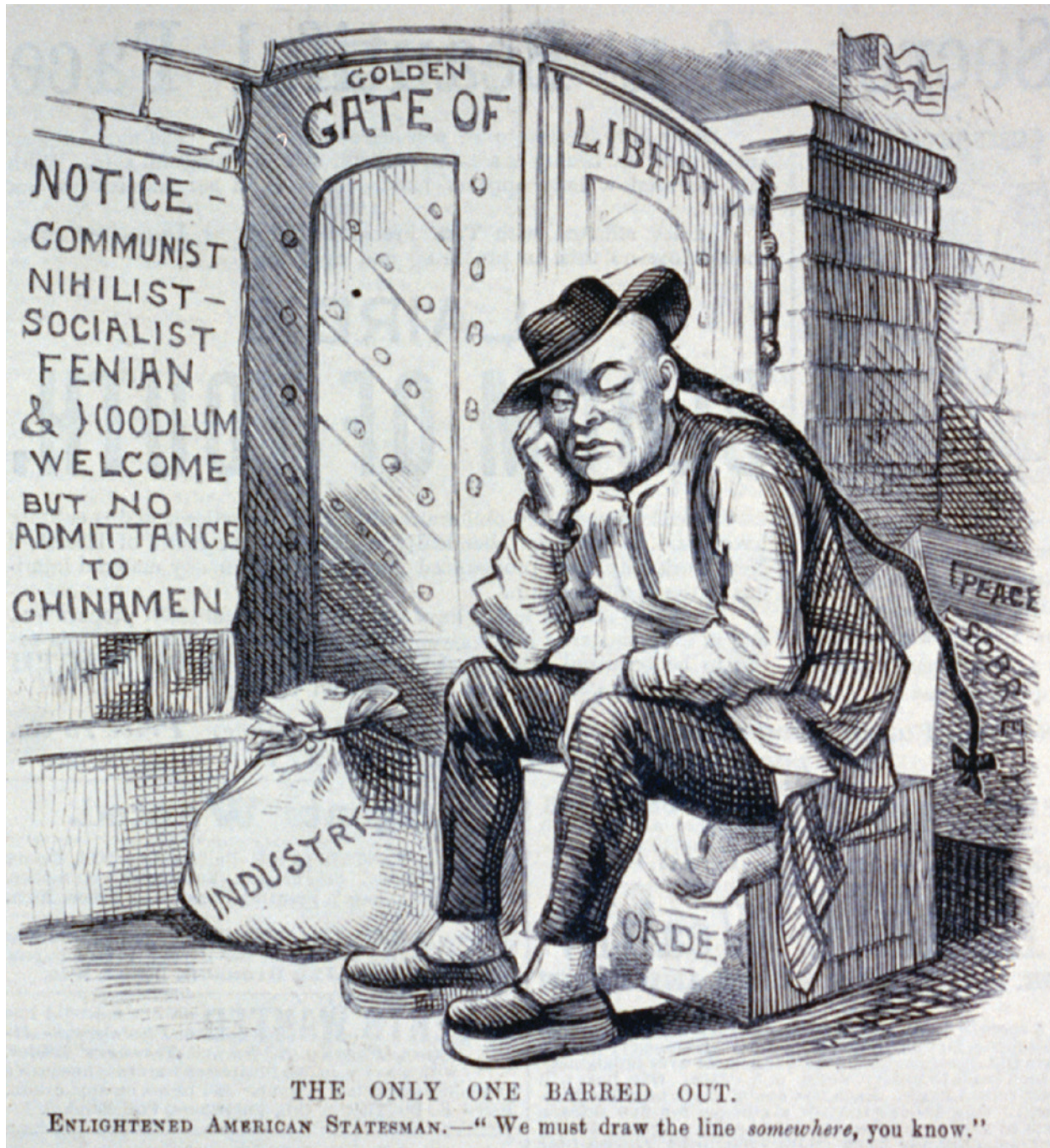
Cartoon by Frank Leslie.