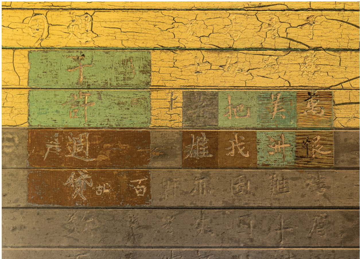
Poem on the walls of the Angel Island Immigration Station, California.